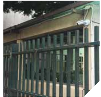
AXIS P14 Series of outdoor-ready bullet-style cameras with IR LED were installed on the school fences, providing stable and clear high image quality around the clock in any weather condition.

For Rixin, the next step will be to proactively detect and defend threats. The school has tested Axis' innovative AXIS Perimeter Defender, a flexible and accurate add-on application which conducts intelligent video analysis at the camera front-end and minimizes false alarms. Rixin is very satisfied with the trial results. In next phase, the full-campus video surveillance system will be installed by stages and by designed areas. Rixin aims to further improve the analysis and alert efficiency through the complete Axis perimeter protection solution, supporting a safer learning environment for the students.