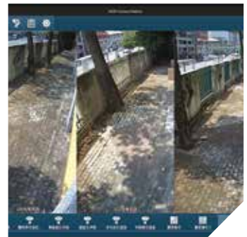
The user interface of AXIS Camera Station video management platform is simple and intuitive. The screen displays vertical images in a 9:16 aspect ratio, which can increase the range of surveillance along the school fence and reduces the number of cameras required.